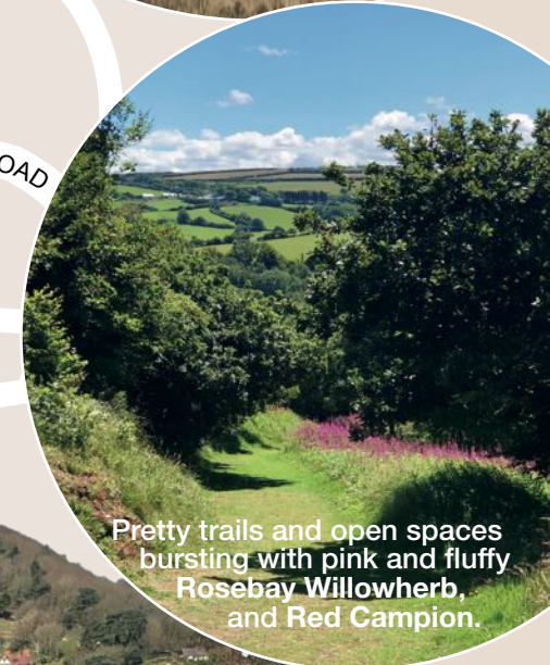
Pretty trails and open spaces bursting with pink and fluffy Rosebay Willowherb, and Red Campion.