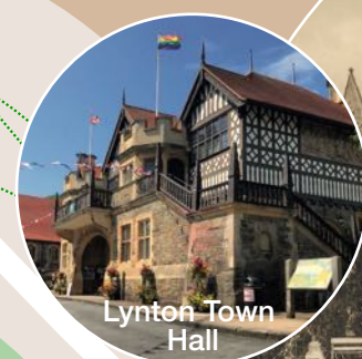
Lynton Town Hall